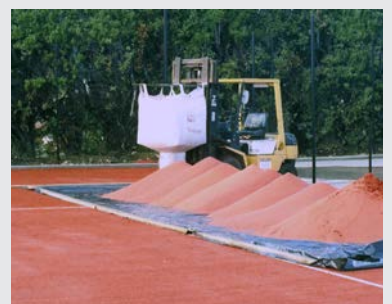
Clay sand infill spread evenly via hoppers across courts