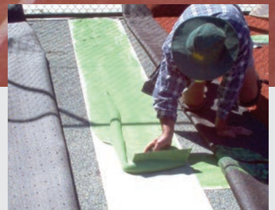
Adhesive troweled onto backing tapes