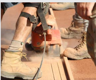
Cut in permanent linemarkings

POLICLAY pave provides even slide behaviour and its excellent water permeability makes it possible for play shortly after rain, extending playing hours ensuring a higher utilisation with lower maintenance requirements.