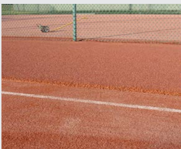
Can be paved over existing surface