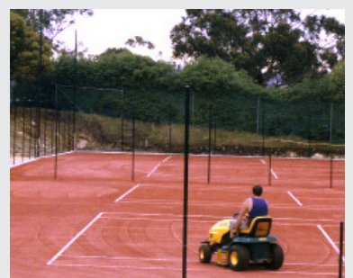
Infill groomed into surface