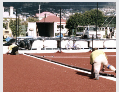
Base line taped and glued into place